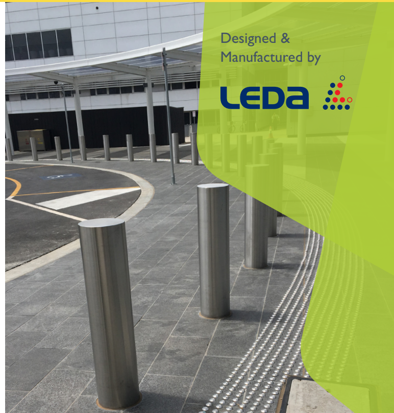
Bollards & Crash Rated Gate Protecting Airport Perimeter